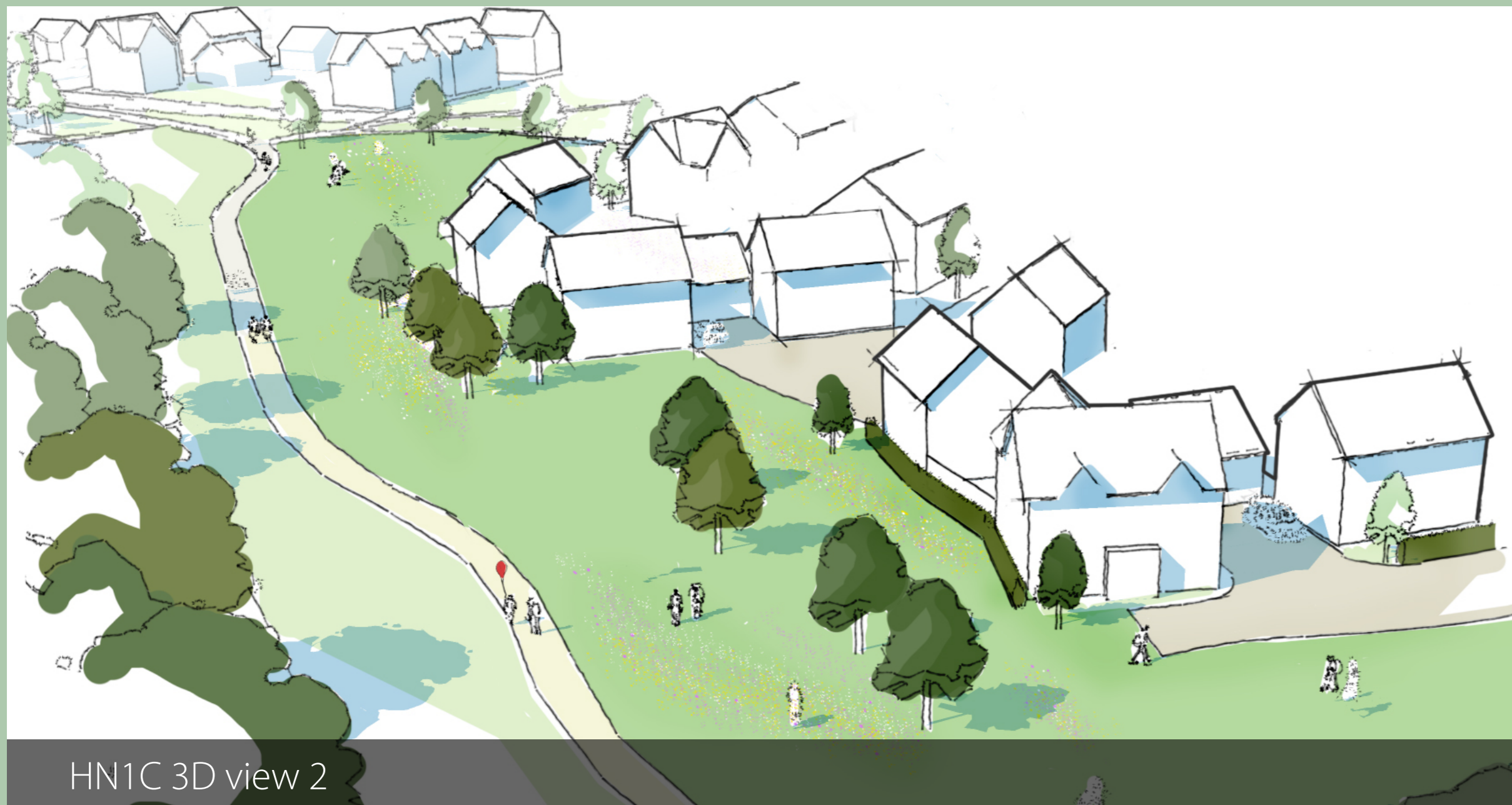
HN1C 3D view 2