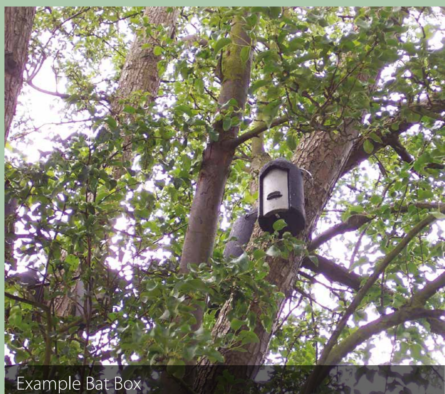
Example Bat Box

The development proposed will also incorporate large areas of public open space which will provide the opportunity for significant ecological enhancement on both sites. Such measures will include creation of wildflower grassland, wetland habitat, and new tree and shrub planting, whilst additional roosting and nesting opportunities will be created for bats and birds, in addition to hibernacula for reptiles, and creation of brush piles for small mammals such as Hedgehog.