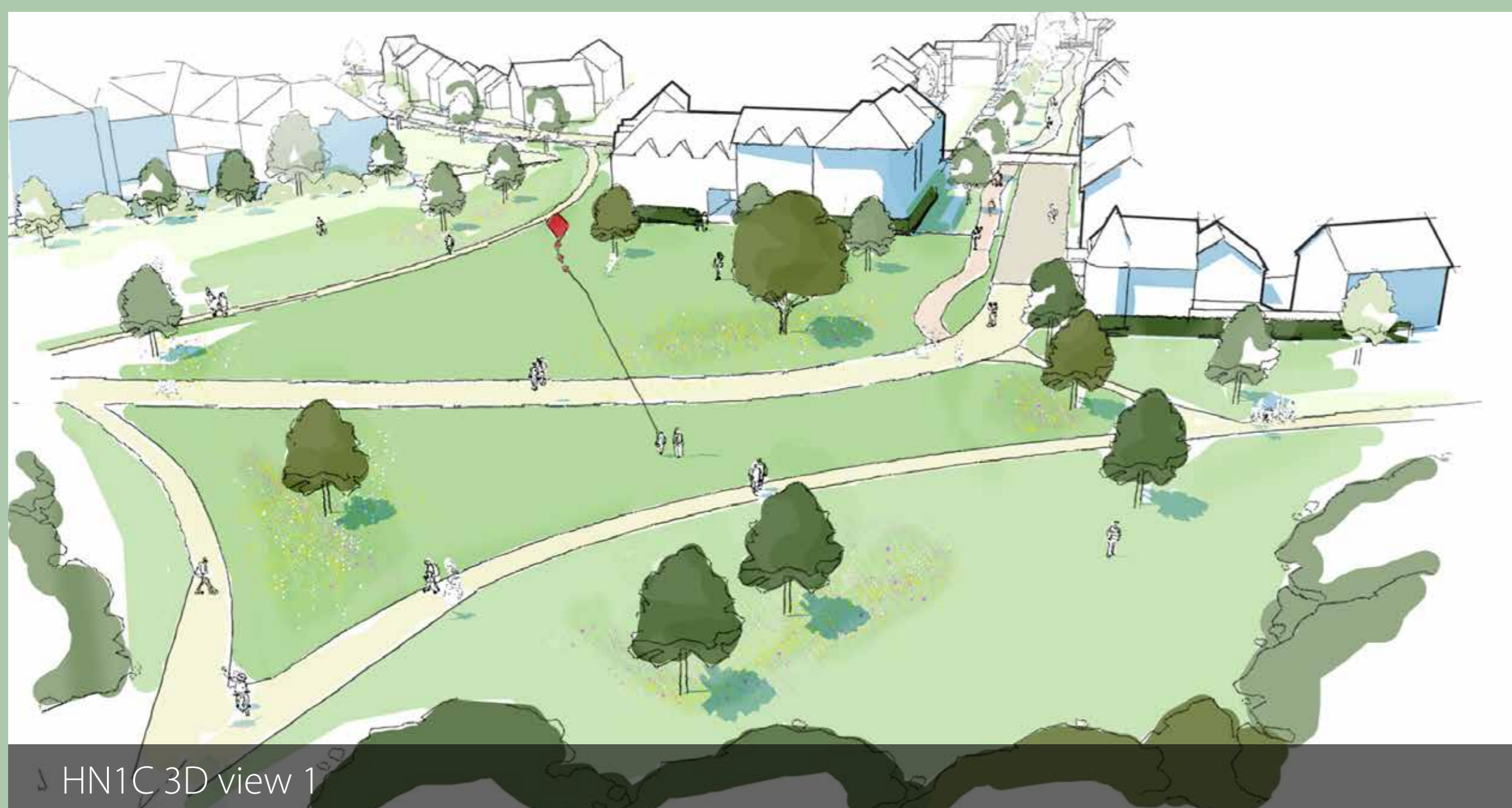
HN1C 3D view 1